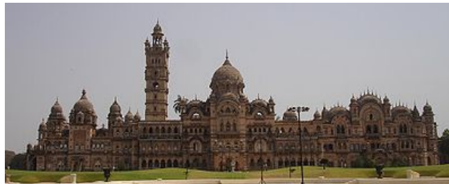
Lakshmi Vilas Palace, Baroda

The national conferences of IAOH spread awareness about safe working practices and comprehensive healthcare of workers. These conferences are all about holistic approach to environmental health and wellness.