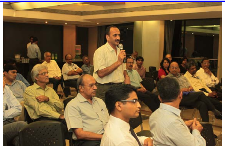
Interactive Session with the audience